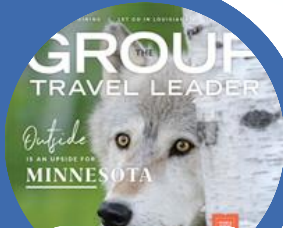
GROUP TRAVEL LEADER