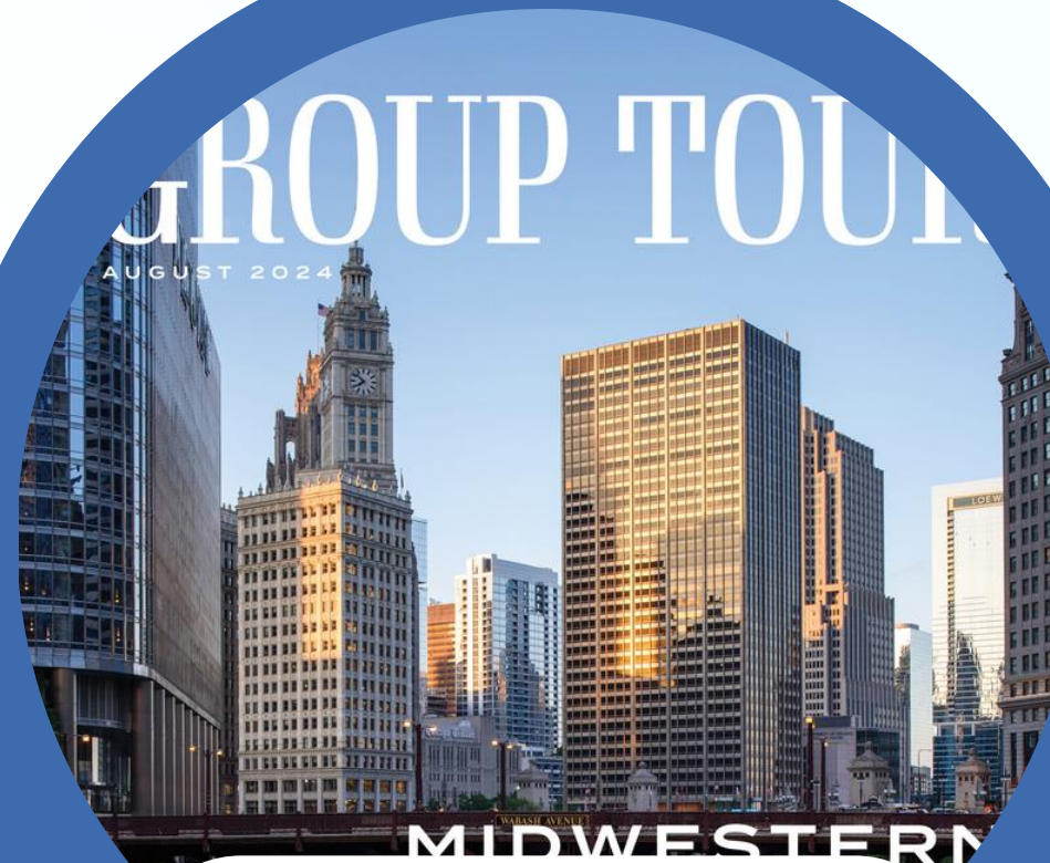
GROUP TOUR MAGAZINE